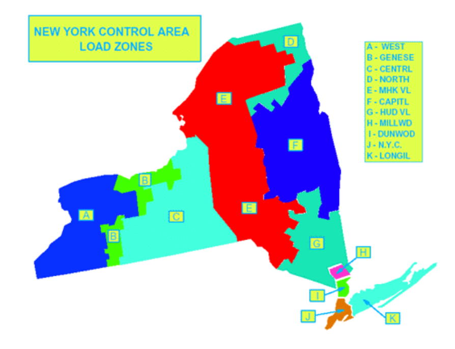
Figure 3. Map of NYISO Load Zones

If the project developer is unwilling to provide this information, then the user should make an informed choice based on the user's examination of the maps.